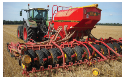
Cover crops being drilled into stubble.

The cover crop options below are not exhaustive and a wide range of options are available, such as phacelia, buckwheat and chicory. They have specific traits useful in certain circumstances; consult an agronomist for details.